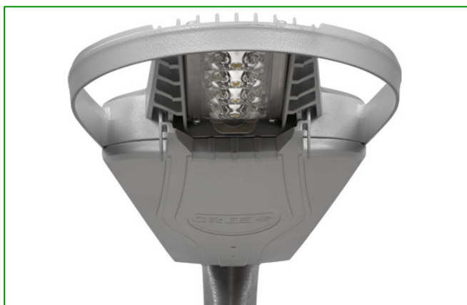
Figure 3 CREE XSPR 42/25 Watt LED Luminaire US$99 "in quantities"

Such aggressive and game-changing pricing from international industry leaders has sent shockwaves through the worldwide industry and has drawn product pricepoints generally down to levels that provide for the lowest life cycle costs of any lighting technology in 2014. Initial prices for Australian-sourced LED luminaires have not yet filtered down to such levels, but prices are steadily decreasing, and performance is increasing.